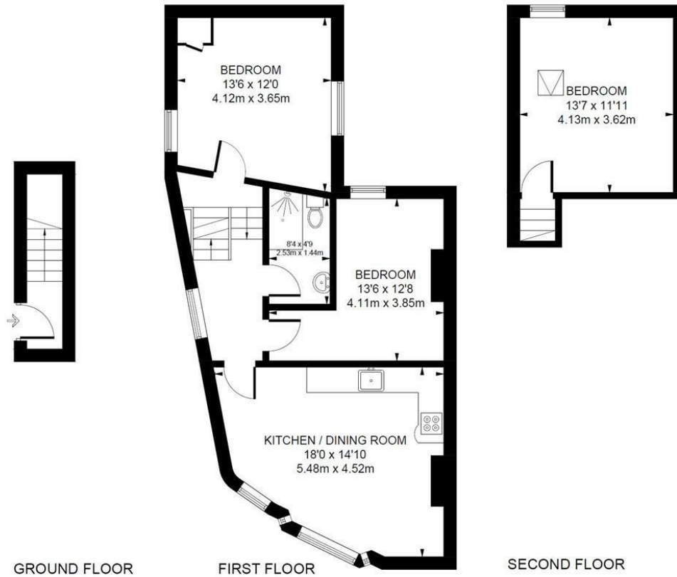
Illustration for identification purposes only, measurements are approximate, not to scale. (ID721379)